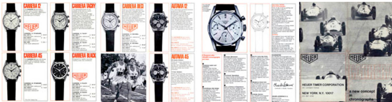
-- A Heuer Carrera Catalog printed in 1964