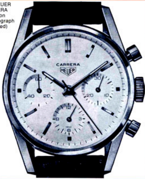
The HEUER CARRERA Precision Chronograph (enlarged)